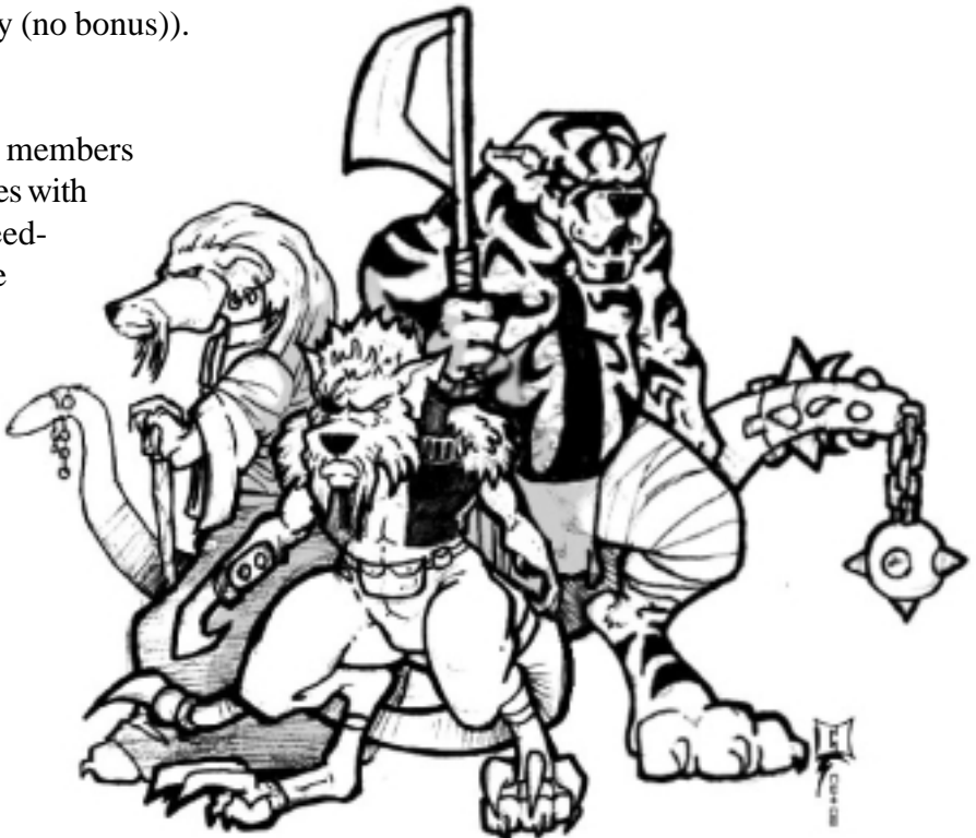
The three clans from left to right. Eruditi, Jorah and Kro.

One of the strangest clans, the members shave all body hair and cover themselves with tattoos. Due to years of selective breeding, the Kro clan are larger than the average Humma (3.5 meters tall). Very warlike, and not too bright. (STR/STA +15, LOG -10)